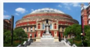
Royal Albert Hall