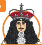
King Charles II