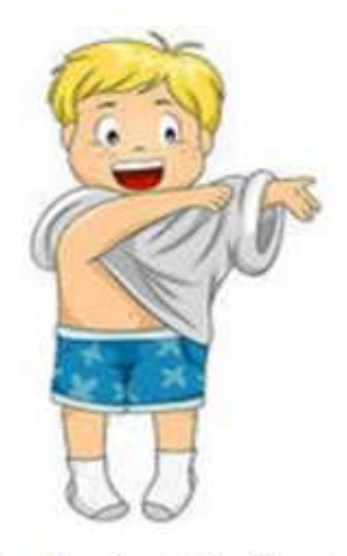
Dress and undress him/herself.

When your child starts school it would be helpful if he/ she could do some of these things: