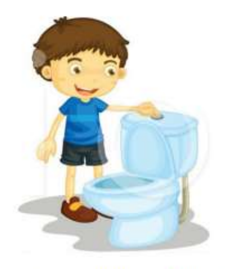
Use the toilet properly and flush it.