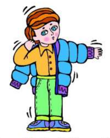
Put on and fasten his/her coat.