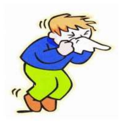
Blow his/her own nose.